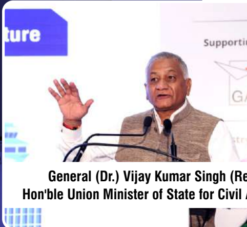
General (Dr.) Vijay Kumar Singh (Retd.) Hon'ble Union Minister of State for Civil Aviation,